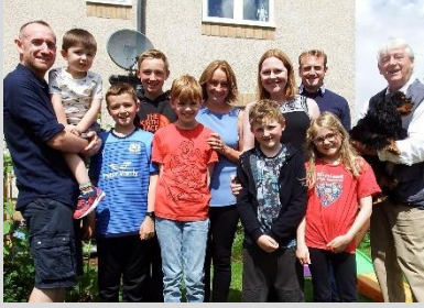
All the family pictured at our party in July