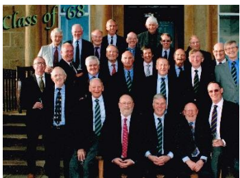
50-year School reunion in Glasgow in May