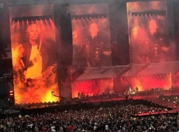
The Rolling Stones at Murrayfield