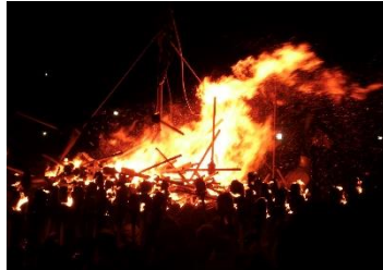
I was at the "Up Helly Ah" Festival in Shetland in January