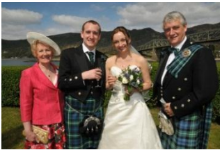
Us with the happy couple!