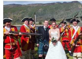
They got mixed up in a battle at Ballachullish !