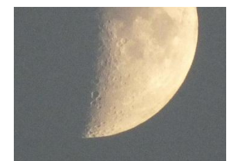
The Moon at Lundin Links in October