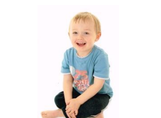
Murray nursery pic